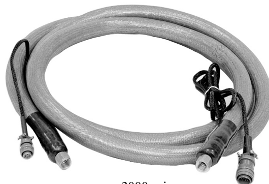
2000 psi heated hose