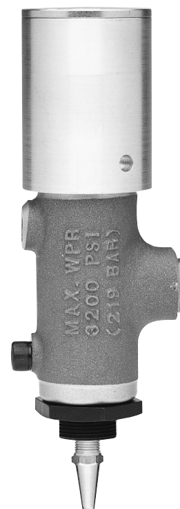
C02-078 Model 482-DA Nozzle not included