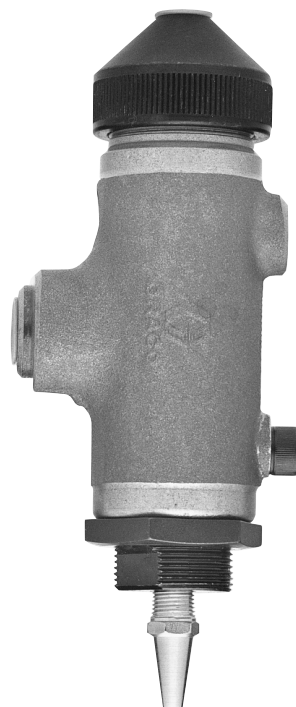
C02-022 Model 482-C Nozzle not included

Nozzles See Form No. 305-538 or 305-567.