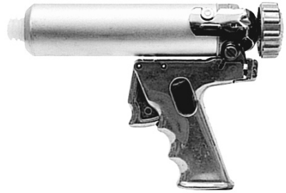
Pistol Grip with 6 oz. Cartridge