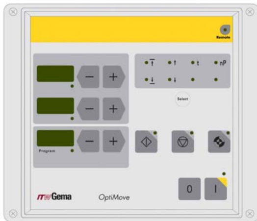
The technologically advanced OptiMove Control Unit

Modern reciprocators call for modern controllers. For this reason, the ZA04 RECIPROCATOR and XT09 POSITIONER are controlled by the technologically advanced OptiMove™ Control Unit. This controller displays accurate digital readouts and is capable of handling up to 255 reciprocating programs. This allows you to precisely control gun positioning and movement for maximum flexibility.