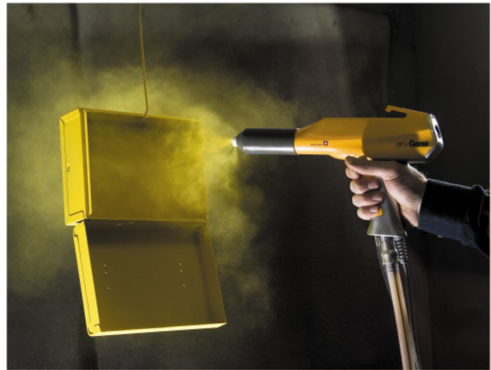
The OptiSelect FirstPass Power Gun is capable of coating challenging parts with ease.